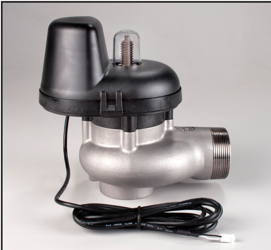
Order No. V3098 • NPT Order No. V3098BSPT • BSPT