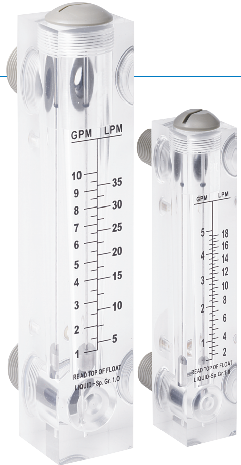
AXEON® Standard Flow Meters