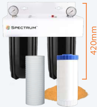
EWS-10K 1" Ports