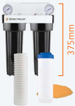
EWS-4K 3/4" Ports