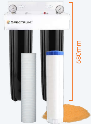
EWS-21K 1" Ports